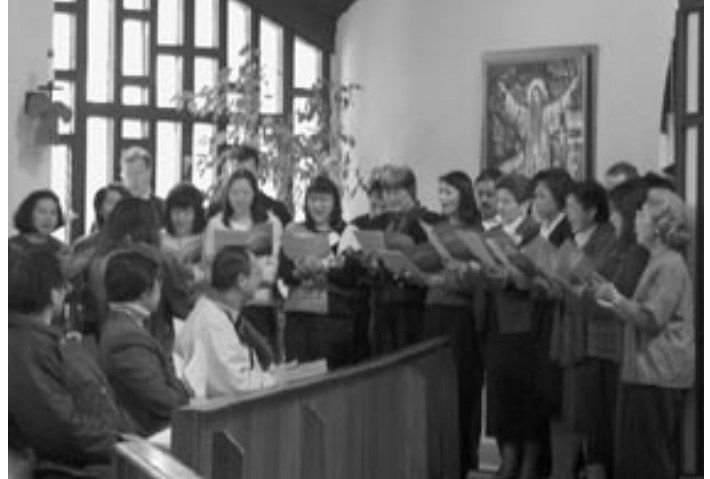
below: New Life's Youth and Young Adult Fellowships perform a skit.