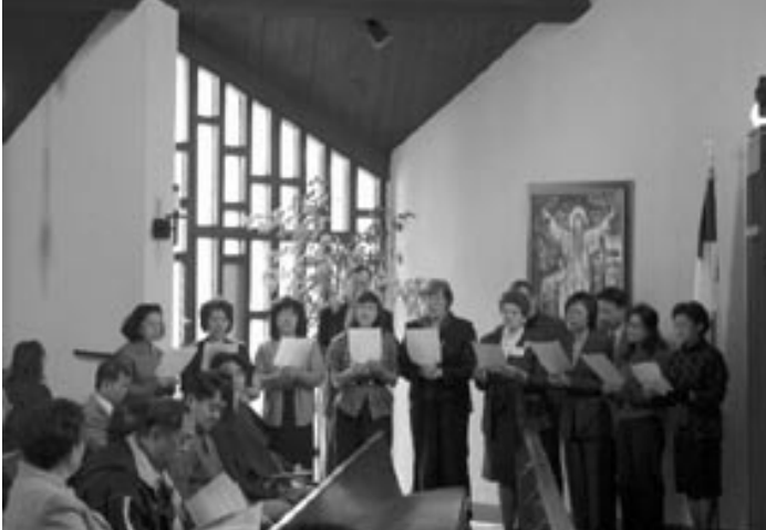
above: New Life and Shepherd of the Hills choir lift up their voices to sing thanksgiving praises.