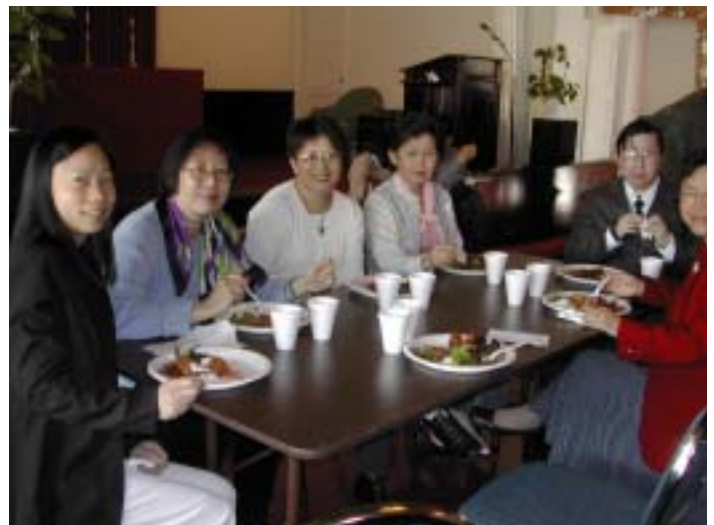
Good friends enjoy good conversation