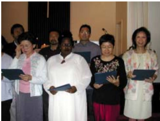
New Life Choir