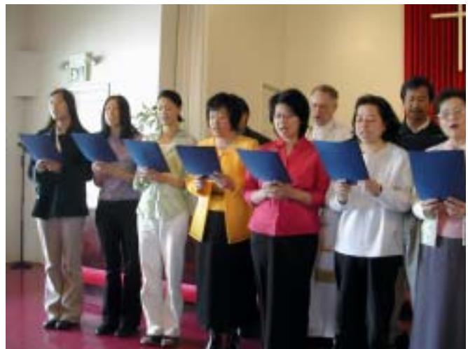
New Life Choir