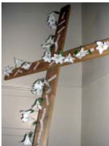
Easter lilies and receipt stubs on the Good Friday cross

I was surprised to see such a large turnout. In the Order of Worship, the seven last words of Jesus were read and meditated upon while Pastor and lay preachers gave a short devotion on each passage.