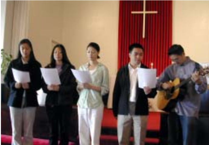
C2 Fellowship sings for choir

I've been to a lot of Easters, but I honestly think that this year's was the best ever. †